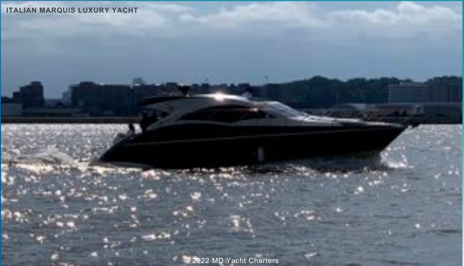
ITALIAN MARQUIS LUXURY YACHT

Due to high demand, once the contract has been issued, your requested charter date and time slot will be held for a two-hour time period to complete the following: 1) sign the contract and 2) send the required deposit. If we do not receive the deposit and executed contract within the two-hour window, your selected time slot will become available again.